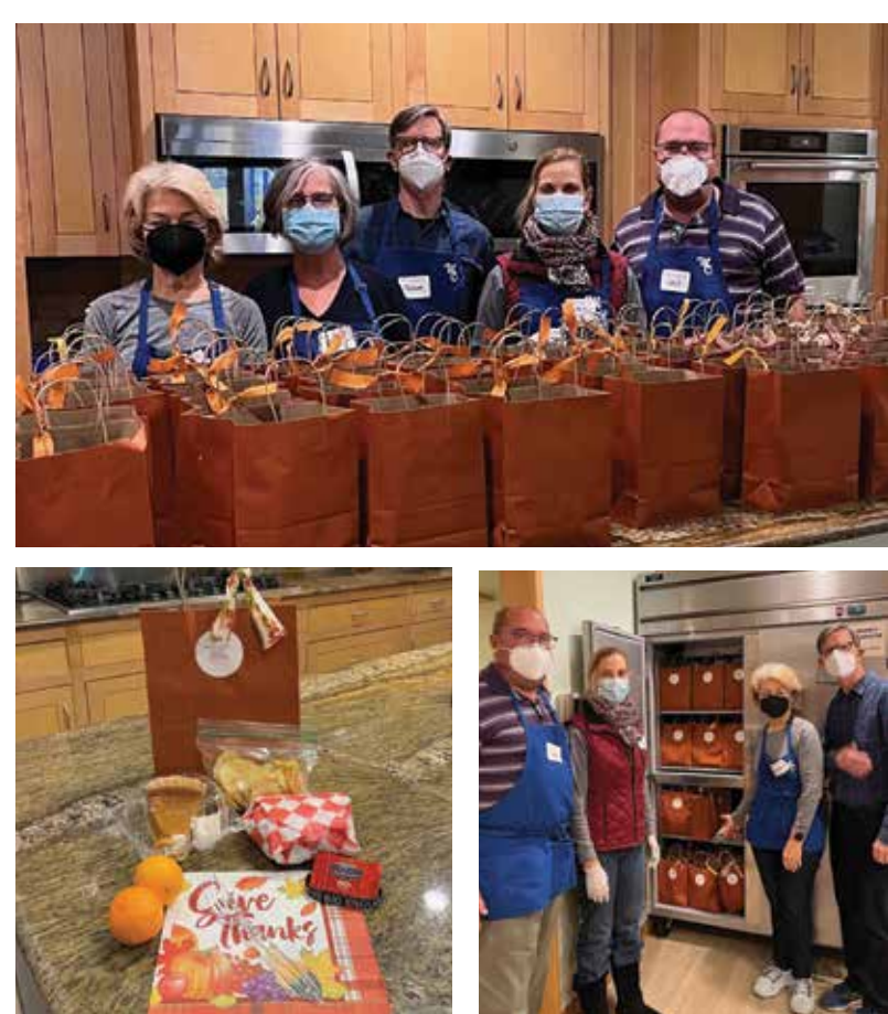
A dream team consisting of rotating volunteers travels every week to downtown Fort Worth to the Ronald McDonald House. Each week, they package meals and fill the refrigerator for families of critically ill children. This is one of many ministries at White's Chapel that depends on volunteers to be the hands of Jesus to the poor, the weak, and the needy. As the new year begins, please prayerfully consider giving your time to one of our helping hands ministries.