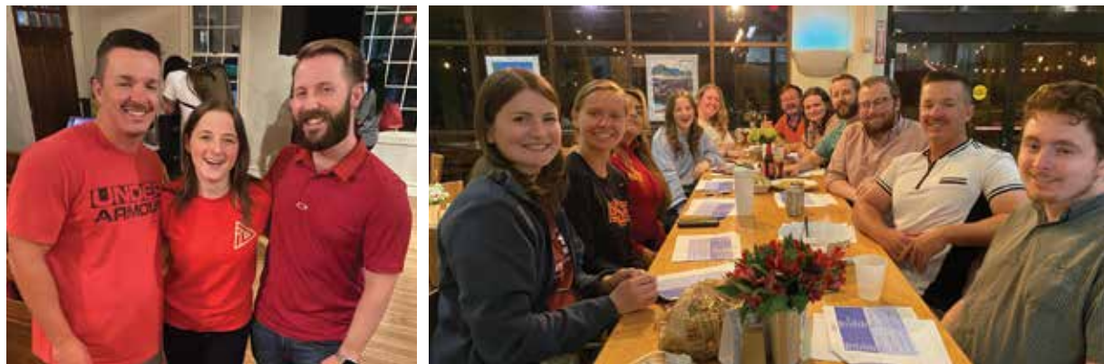
A few of our Young Adults recently participated in the White's Chapel Habitat for Humanity project. The group meets monthly for various activities, including Bible and Brew.