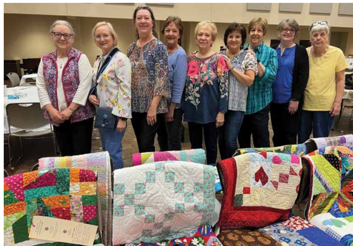
Many thanks to our wonderful WC Quilting ladies who made beautiful baby quilts to give to 25 local active military families during an Operation Homefront baby shower co-hosted by White's Chapel.

Opportunity abounds for all who are interested. And this Sunday, all you have to do is ask.